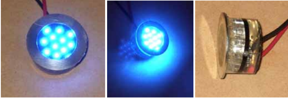
Lotus disc SS 32